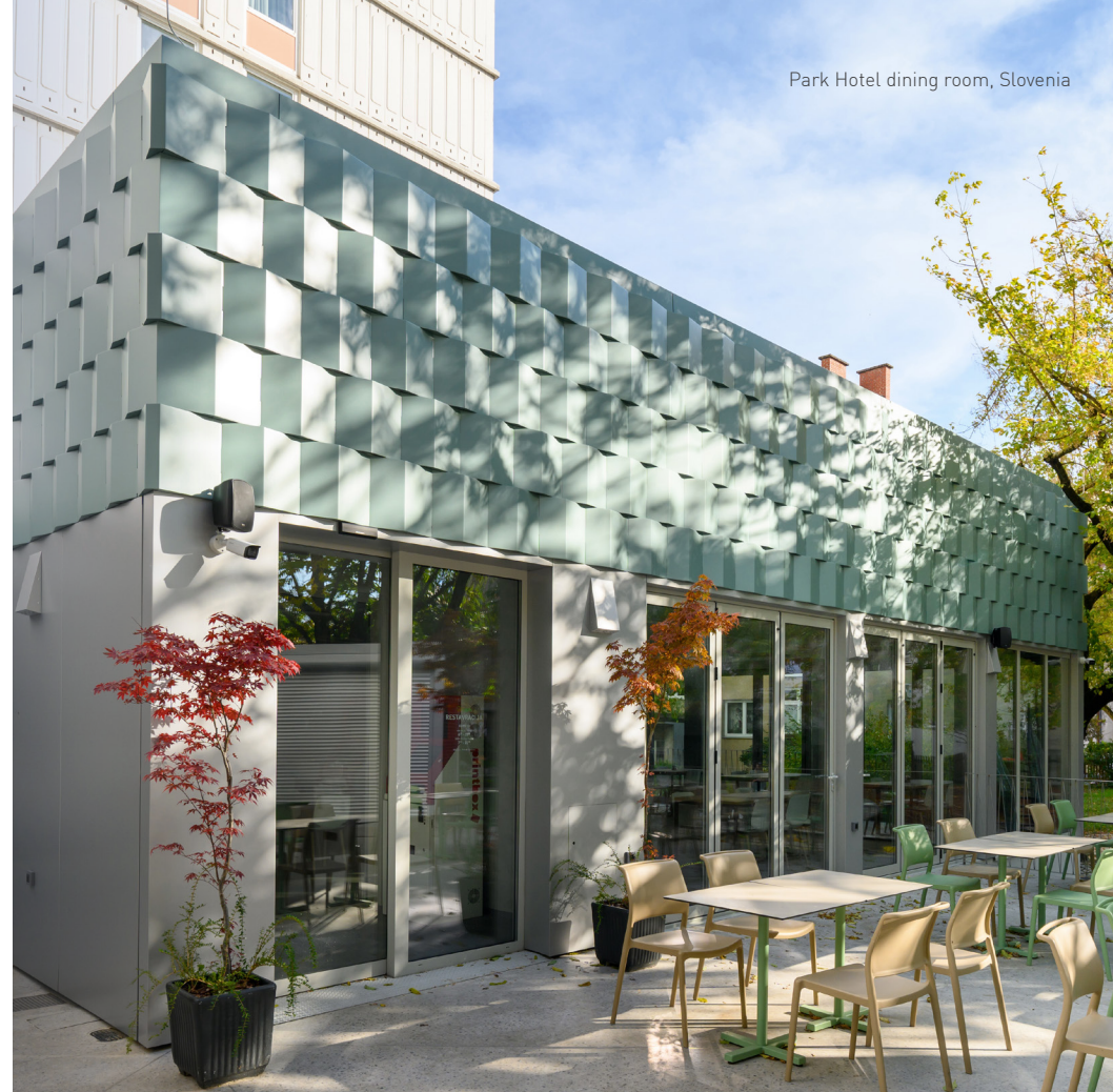
Park Hotel dining room, Slovenia