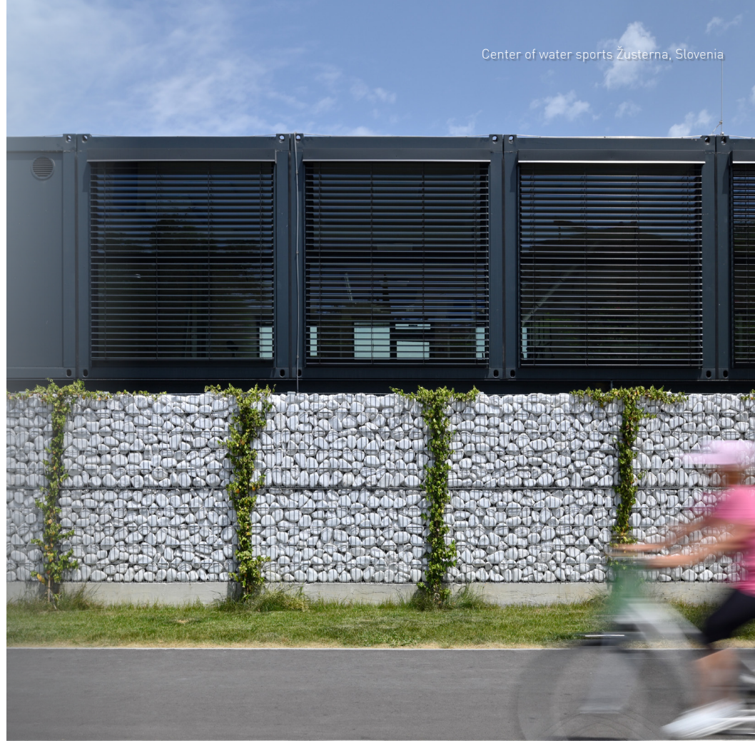
Center of water sports Žusterna, Slovenia