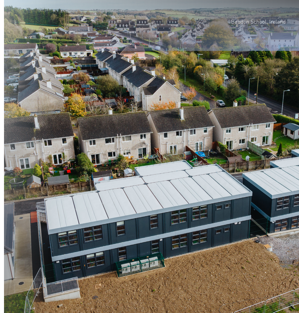
Bandon School, Ireland