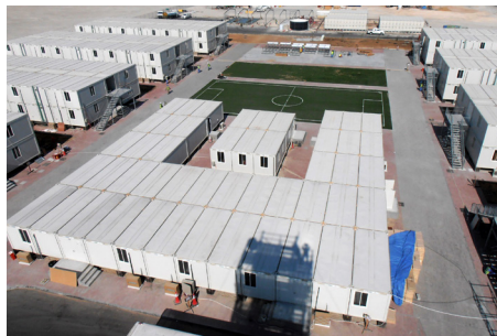
Oil Rig Field Camp Support, Hassi Messaoud, Algeria