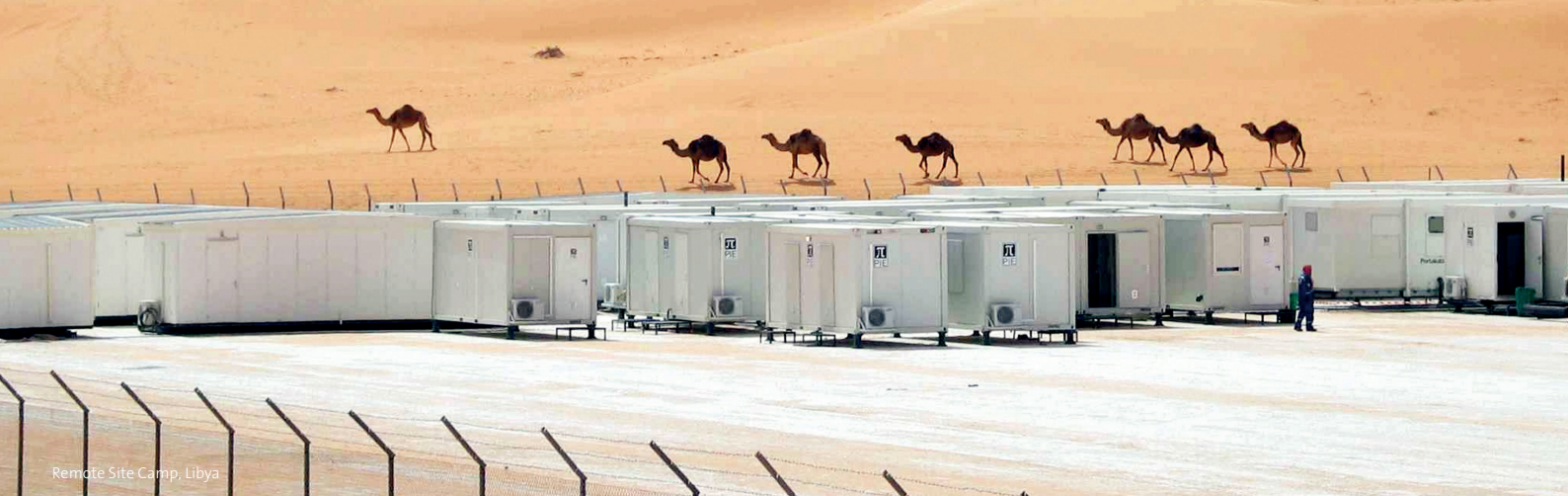
Remote Site Camp, Libya