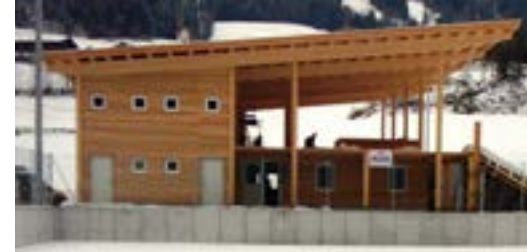
Sports Facility, Alpbach, Austria