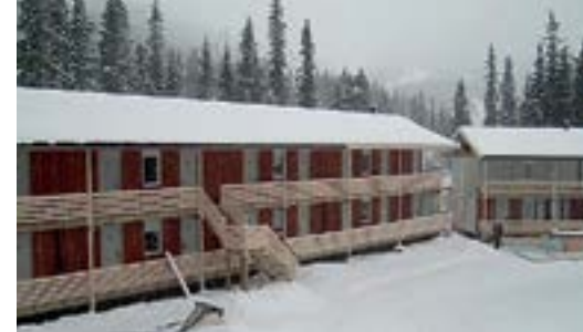
Hotel, Hemsedal, Norway