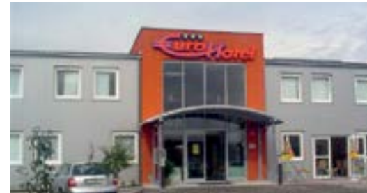
Eurohotel, Pettenbach, Austria