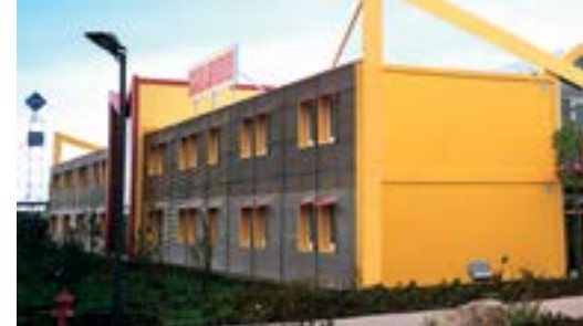
Motel Pelikan, Dettelbach, Germany