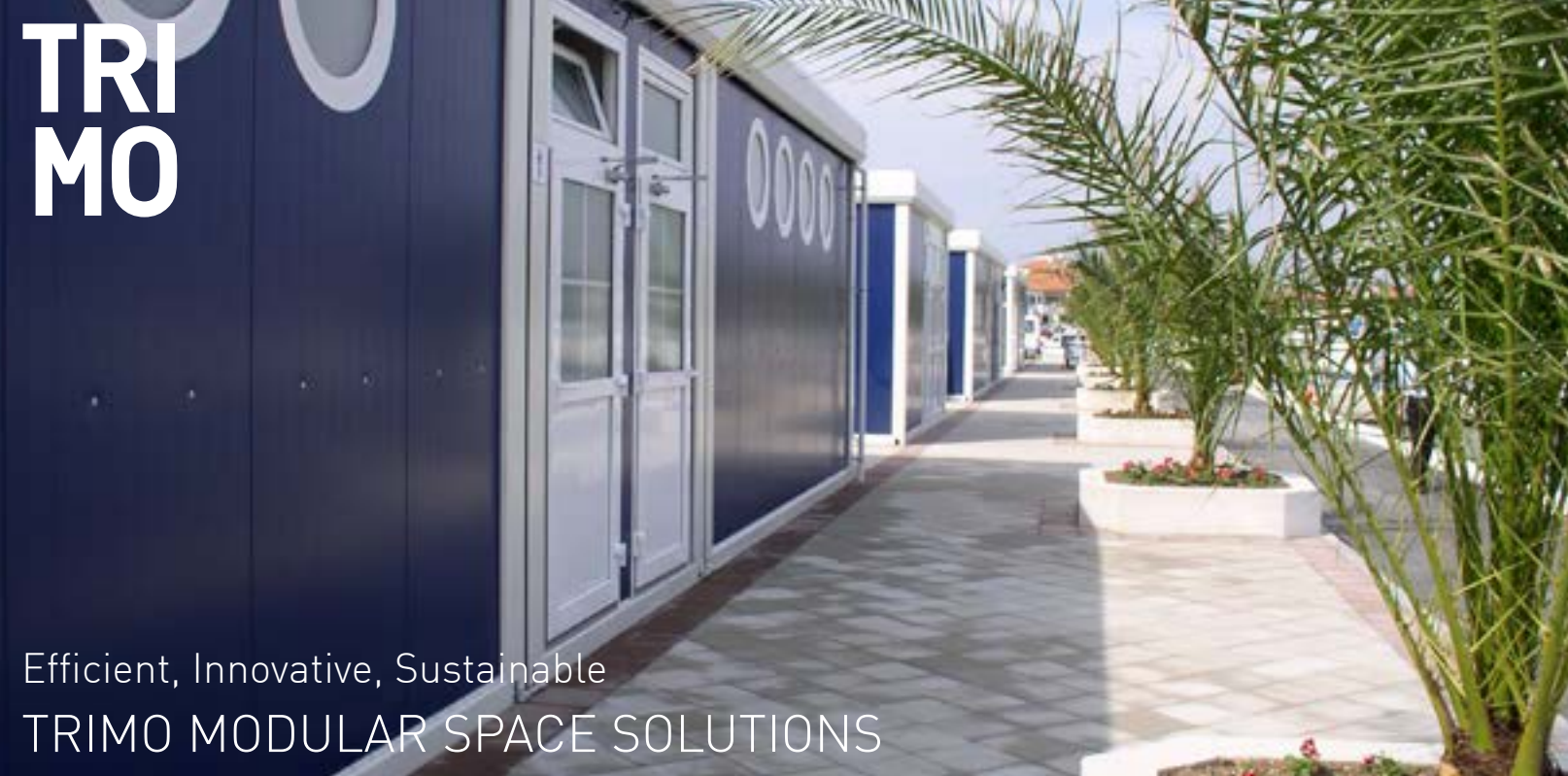
Sanitary Block and Shop, Marina Kornati, Biograd na moru, Croatia