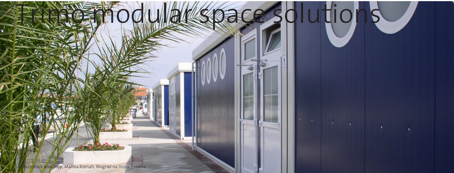
Sanitary Block and Shop, Marina Kornati, Biograd na moru, Croatia