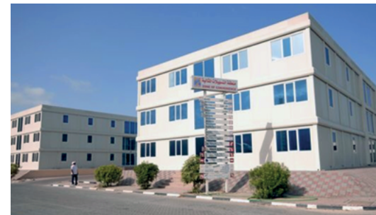
Free Zone Authority, Fujairah, UAE