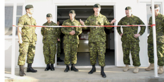
Accommodation Units and Medical Facility, Bugojno, BiH