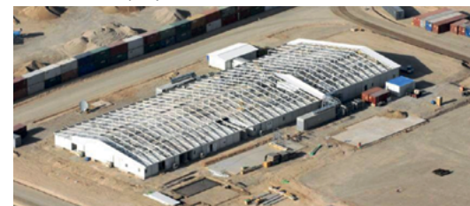
Hospital, Kandahar, Afghanistan