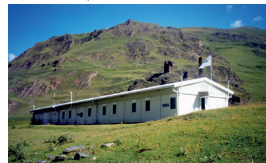
Accommodation Units OSCE, Girevi, Georgia