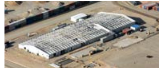
Hospital, Kandahar, Afghanistan