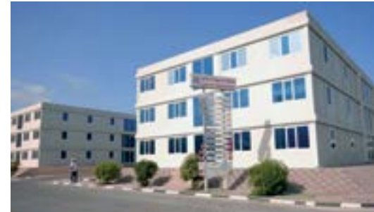
Free Zone Authority, Fujairah, UAE