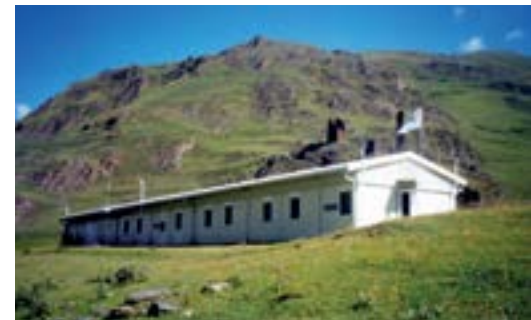
Accommodation Units OSCE, Girevi, Georgia