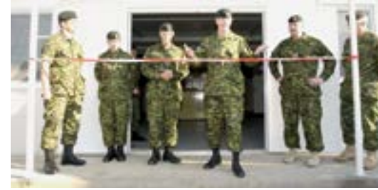
Accommodation Units and Medical Facility, Bugojno, BiH