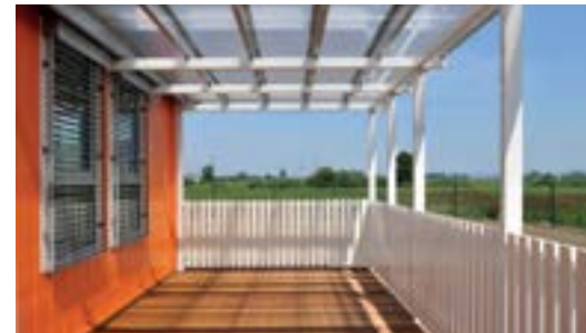
Kindergarten, Podpeč, Slovenia