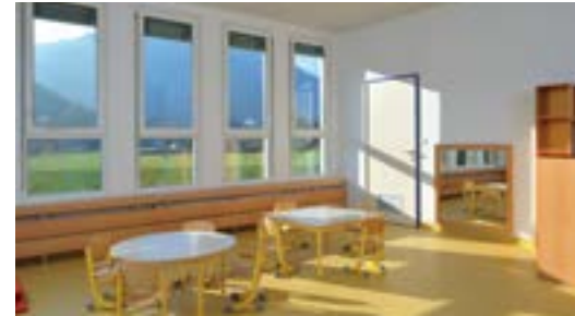
Kindergarten Biba, Škofja Loka, Slovenia