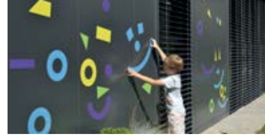
Kindergarten Ajda, Ravne na Koroškem, Slovenia