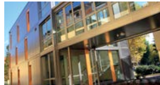
Faculty of Medicine, Ljubljana, Slovenia