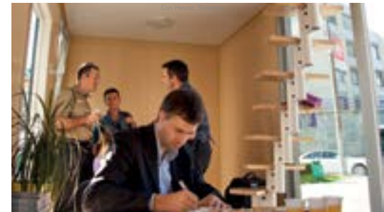
Ground Level Office, New York, USA