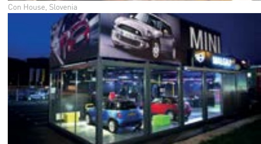
MINI Car Showroom, Ljubljana, Slovenia