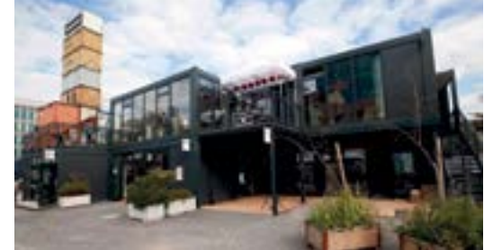
Art Shop, Zürich, Switzerland