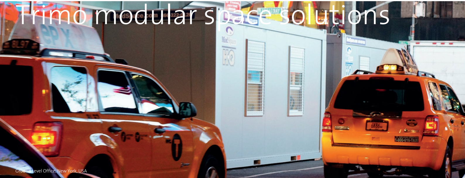
Ground Level Office, New York, USA