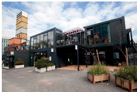
Con House, Slovenia